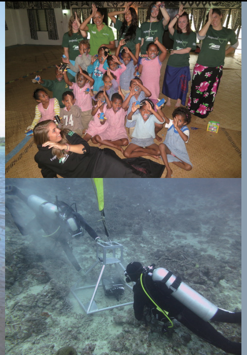
Volunteers deploying the Baited Remote Unwater Vehicle for shark population monitoring (Projects Abroad) 志愿者正在安放装有诱饵的水下遥控设备, 用于监测鲨鱼数量

Projects Abroad提供世界各地的保护项目, 其中一个不能不提的就是斐济维提岛上的Fiji Shark Conservation and Awareness Project。在这个久负盛名、组织良好的项目中, 志愿者们可以和鲨鱼科学家及研究员在鲨鱼研究潜水行与鲨鱼追踪项目里合作。他们还可以参加红树林修复项目、社区外展活动、鲨鱼教育动员并了解斐济当地的文化。每个志愿者项目都会留出时间供他们在贝加潟湖与无数牛鲨同潜。没有潜水经验的志愿者可在前两周训练成为PADI高级潜水员, 迅速融入环境。不论何种背景, 都欢迎报名前来; 参与时间至少两周。很多志愿者已经参与多次, 欢迎网上提交申请表