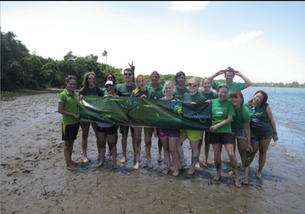
Mangrove restoration volunteer group picture in Fiji (Projects Abroad) 红树林修复的志愿者集体照, 摄于斐济